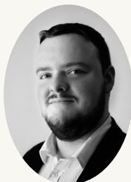
Lucas Pauchet TÉNOR